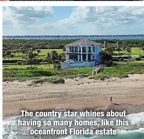
The country star whines about having so many homes, like this oceanfront Florida estate

COUNTRY king Jason Aldean's tone-deaf complaints about how tough it is being so rich have hit a sour note with fans.