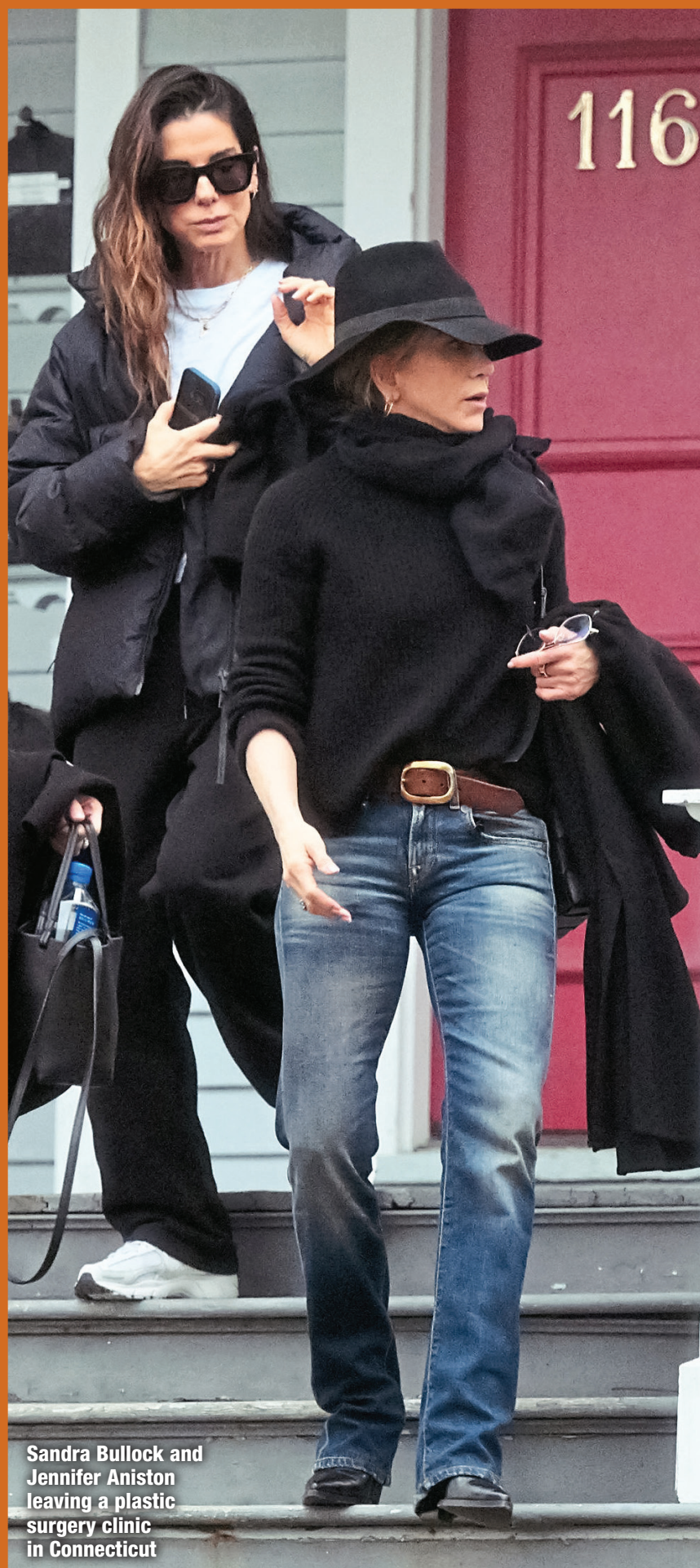
Sandra Bullock and Jennifer Aniston leaving a plastic surgery clinic in Connecticut

"He isn't fooling anybody," the source sniffs. "It will take more than a facelift to convince voters. They're smarter than that."